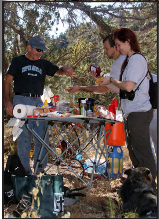
Jack's Canyon Clean-up.