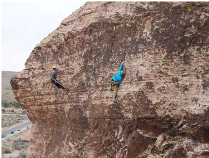
Tandem Climbing on Cannibal Crag

That evening, rain was added to the weather fun, which puts sandstone on the 'do not climb' list for at least a few days as it dries out. So Monday, despite continued overcast skies, cold temperatures, and windy conditions, we decided to try one of the many hiking trails in the Red Rocks state park. The route we chose was the White Rock Loop. This loop of about 6 miles was a good choice for the day's activities, as the weather had one final surprise for us... snow!