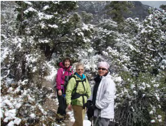
Snow in Red Rocks

Exactly one week later we found ourselves in Red Rocks State park near Las Vegas, Nevada. We were attending the Red Rocks Rendezvous, sponsored by Mountain Gear and attended by hundreds of rock climbers from all over North America. Held every year, the Red Rocks Rendezvous is centered around a weekend long climbing seminar, including specific climbing related classes for all skill levels, gear sales, product demonstrations, and fun events (such as this year's pancake eating contest). Primarily, our interest was climbing in the Red Rocks area, which has hundreds of routes scattered around dozens of areas on mostly finger friendly sandstone.