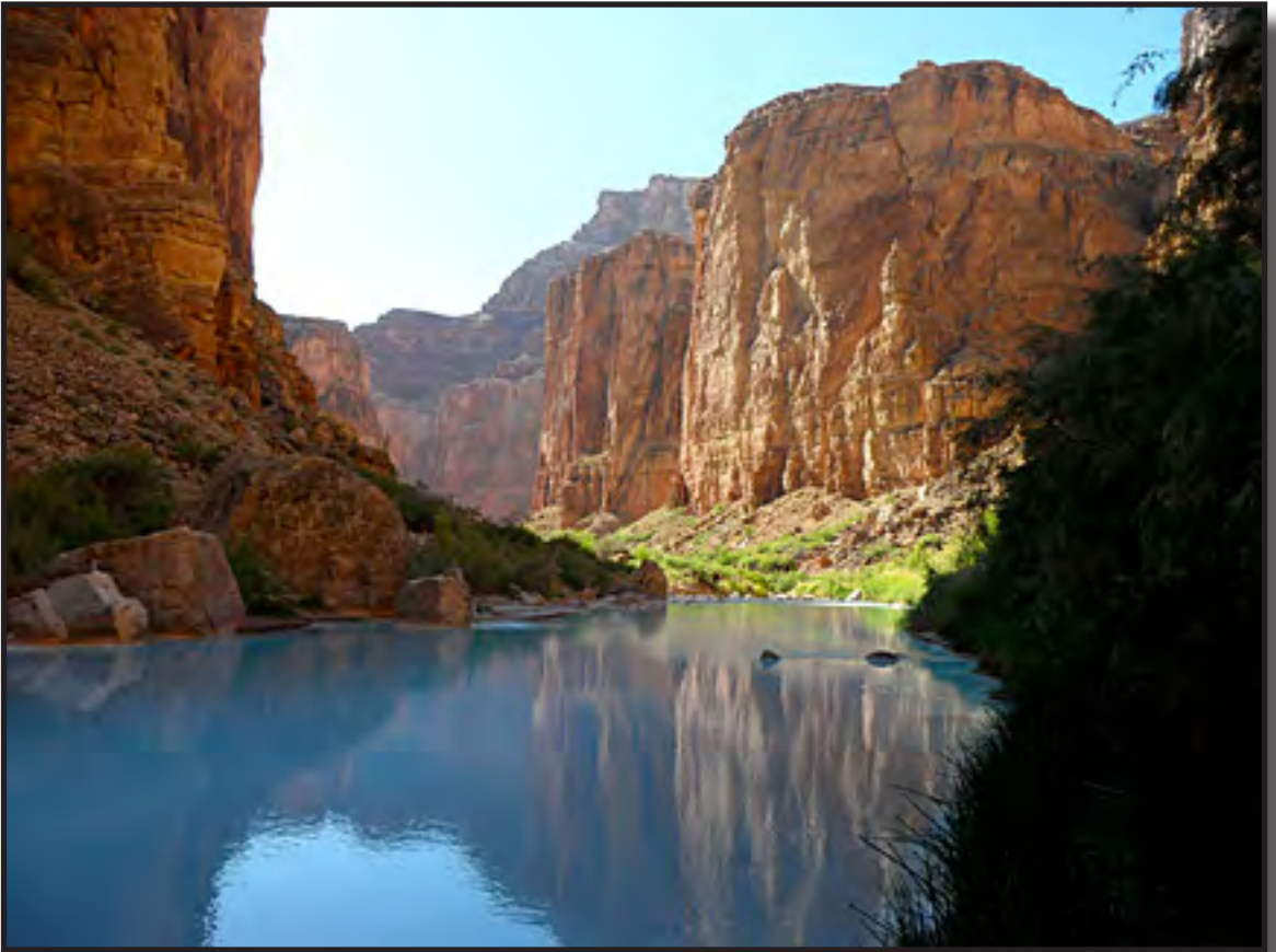
Winner “Overall” Category