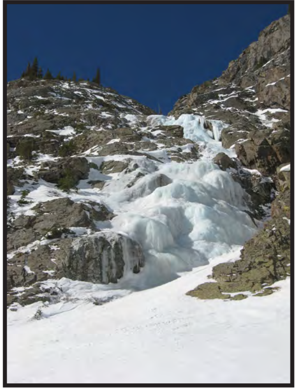
Above: Before Below: During

Within a few minutes I thought I heard an airplane flying up the valley. It kept getting closer and closer. Then I realized that Second Gully was avalanching! Big billows of snow flew over