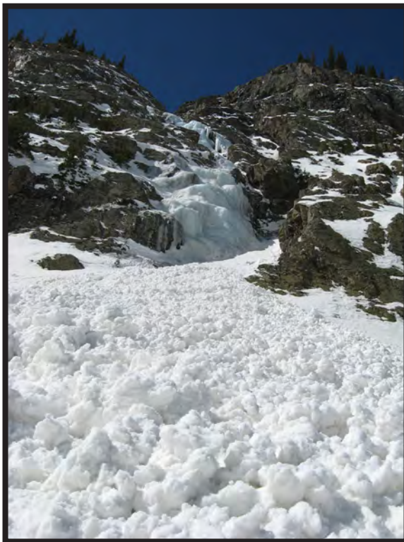
Above: After Below: Ring side seating