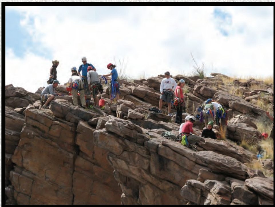
Building Anchors at The Promised Land